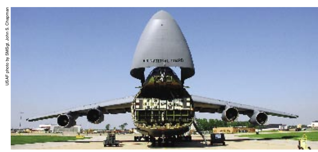
A C-5 from Stewart ANGB, N.Y., takes on cargo on the flight line at Hulman Arpt., Ind., during an exercise.

Youngstown-Warren Arpt./ARS, Ohio 44473-5912; 14 mi. N of Youngstown. Phone: 330-609-1000; DSN 346-1000. Units: 910th Airlift Wing (AFRC); Army Corps of Engineers; Army, Navy, and Marine Corps Reserve units; FAA. History: activated 1953. Area: 230 acres. Runways: three, primary length 9,000 ft. Altitude: 1,196 ft. Full-time personnel: AFRC, 454; ANG, 17. Lodging: 142 beds. Limited exchange.