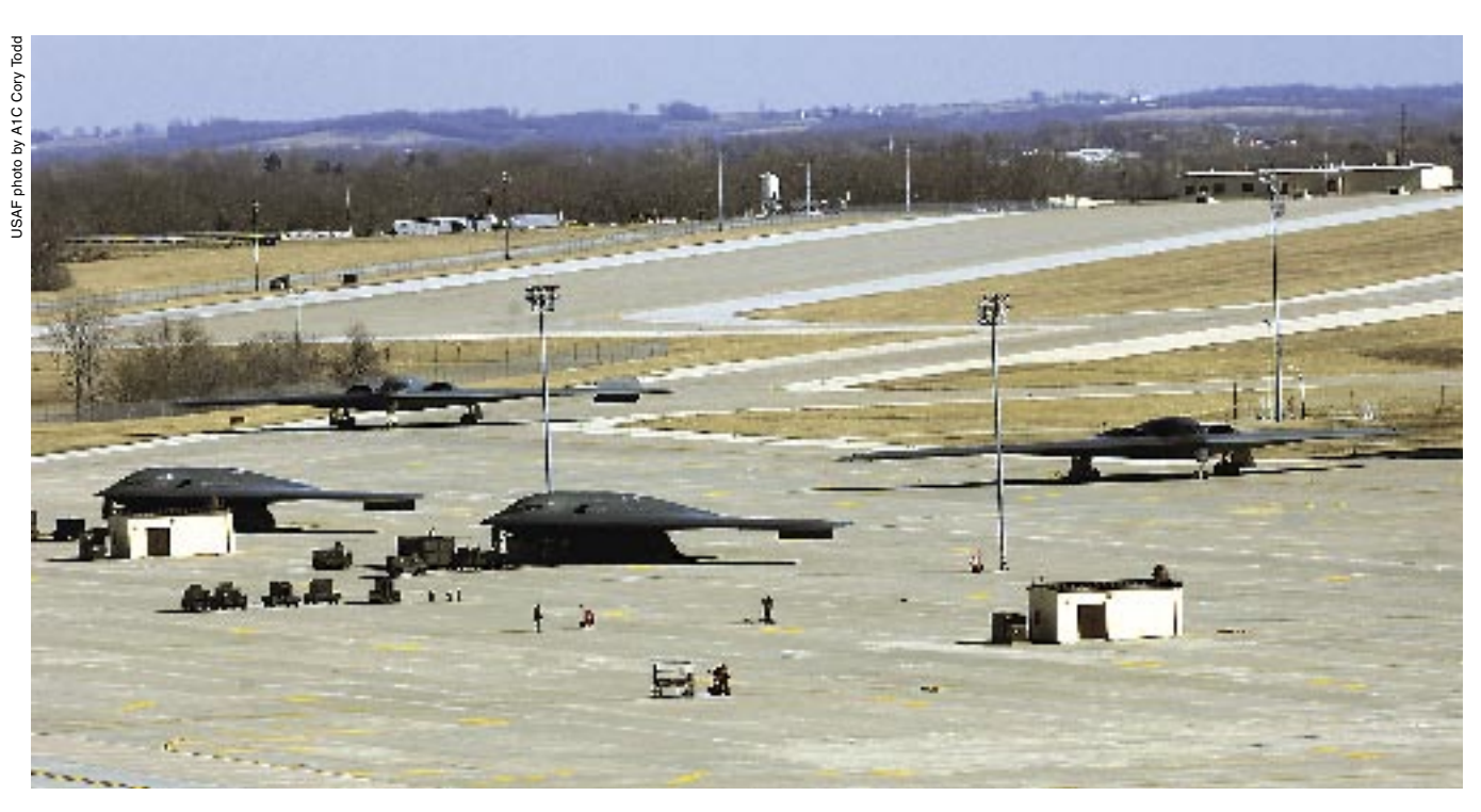
At Whiteman AFB, Mo., two B-2s taxi past another pair of Spirits.

Yokota AB, Japan, APO AP 96328-5000; approx. 28 mi. W of downtown Tokyo. Phone: (cmcl, from CONUS) 011-81-311-755-1110; DSN 315-225-1110. Majcom: PACAF. Host: 374th AW. Mission: C-12J, C-130, and UH-1N operations. Primary aerial port in Japan. Major tenants: US Forces, Japan; 5th Air Force (PACAF); 730th AMS (AMC); Det. 1, Air Force Band of the Pacific-Asia; American Forces Network Tokyo; DFAS-Japan. History: opened as Tama AAF by the Japanese in 1939. Area: 1,750 acres. Runway: 11,000 ft. Altitude: 457 ft. Personnel: permanent party military, 2,737; DOD civilians, 199. Housing: single family, officer, 683, enlisted, 1,956; unaccompanied, UOQ, 184, UAQ/UEQ, 896; visiting, VOQ, 202, VAQ/VEQ, 23, TLF, 189. Hospital.